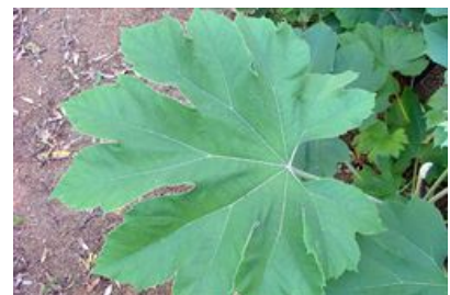
large leaf with several lobes