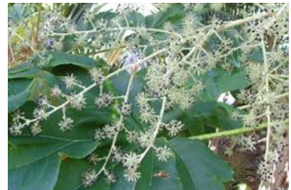
large cluster of fruit