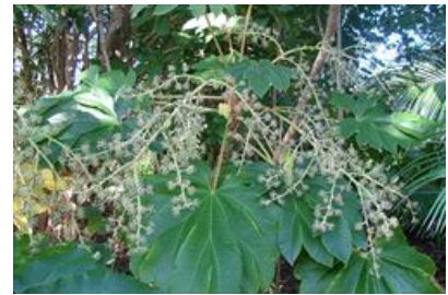
habit in fruit