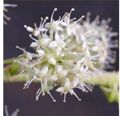
close-up of flowers