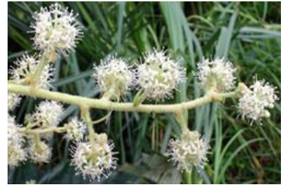
numerous small white flowers