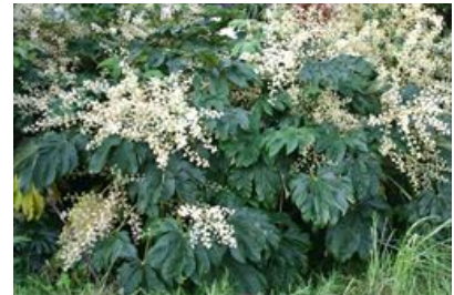
habit in flower