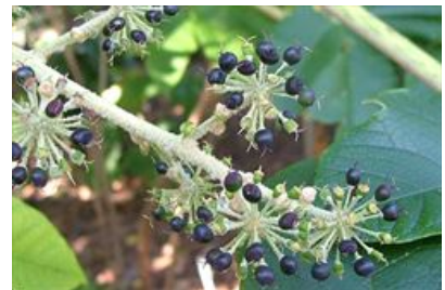
close-up of immature and mature fruit