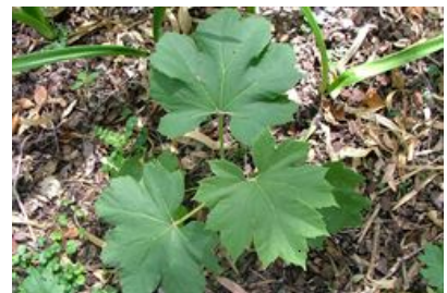
young plant